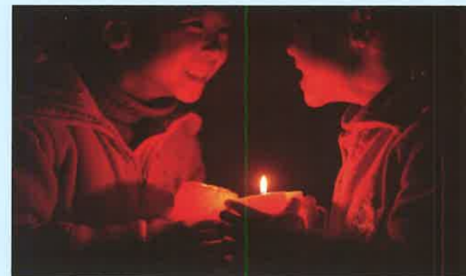
Total fires caused by child tampering